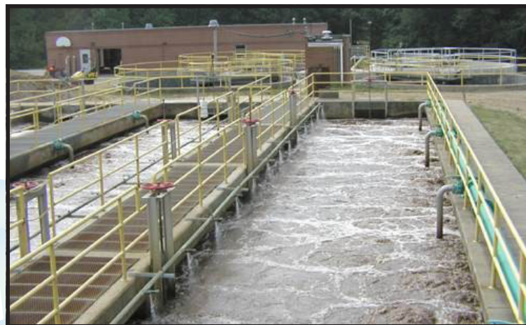
Wastewater Treatment Plant

McCoy & McCoy Laboratories, Inc. (MMLI) professionals have the capabilities to provide the following services to the wastewater treatment plants: